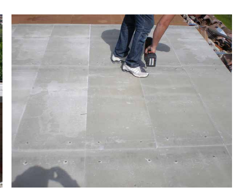
| SYSTEM'S PRODUCTS