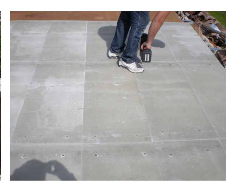
| SYSTEM'S PRODUCTS