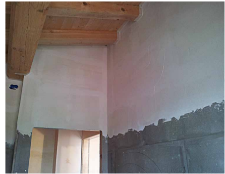
| SYSTEM'S PRODUCTS