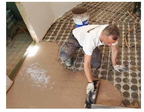
| SYSTEM'S PRODUCTS