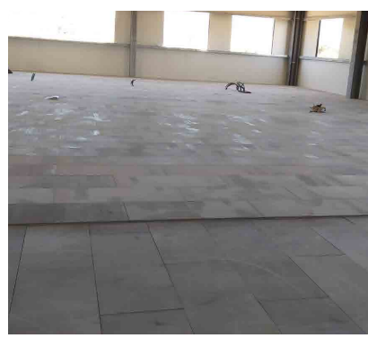
PRODUCTS USED IN THIS SYSTEM