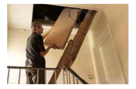
The Fibertherm top boards are light in weight and due to their size of 1200 x 400 mm can be easily fitted through most loft accesses.

Many buildings have been designed with accessible, but not habitable attic spaces. Many households utilise this space for additional storage, by laying boards over the insulated joists. With the introduction of better insulation/energy efficiency requirements, deeper loft insulation is now required.