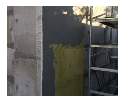
| SYSTEM'S PRODUCTS